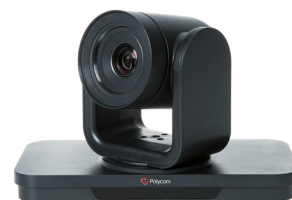
Polycom EagleEye IV 4x Camera (black)