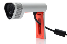
Polycom EagleEye Acoustic Camera