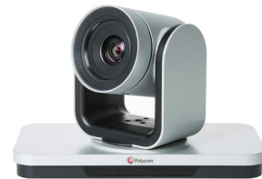
Polycom EagleEye IV 12x Camera (silver)

The Polycom EagleEye Acoustic camera is an optimal solution for a smaller environment. With built-in microphones and small footprint, this camera will easily blend into an executive office or huddle room.